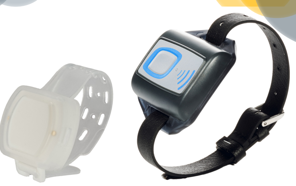
Fig.: Baby- and Mother-Transponder